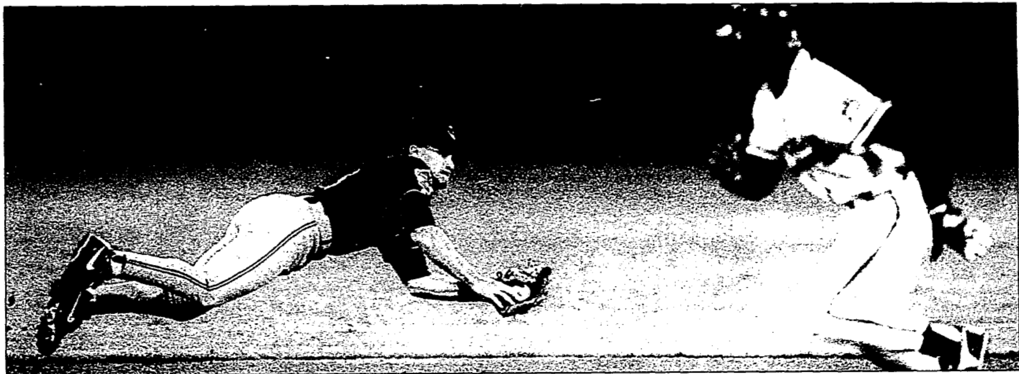
Get shorty: Whether scooping a ball in the hole or barehanding grounders out of the air, Vizquel has used the postseason as a defensive showcase — with the exception of a Game 1 bobble.

H itting comes and goes. Albert Belle can destroy pitching in September, vanish for a week in October, and reappear the next. Same with Jim Thome, Manny Ramirez, Carlos Baeraga and Paul Sorrento. Hitters are Babe Ruth and Ty Cobb today; Duane Kuiper and Bob Uecker tomorrow.